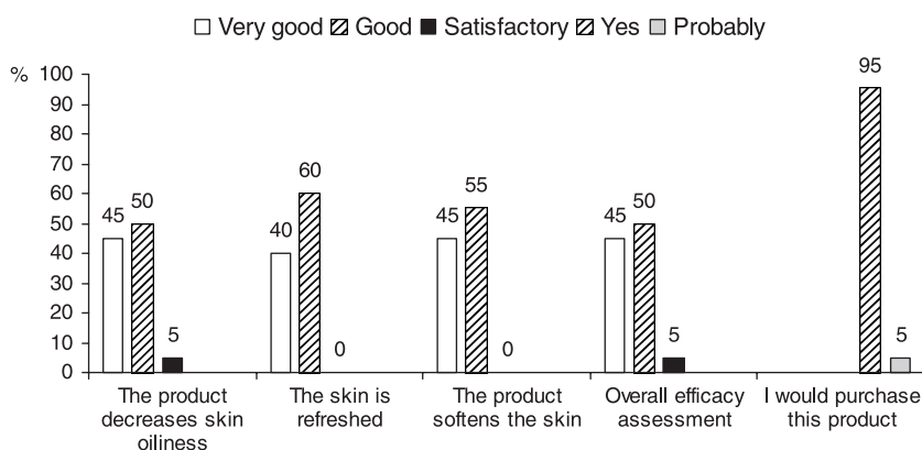
Figure 3 The appreciation of the product efficacy by the participants.

It prevents the conversion of testosterone to dihydrotestosterone by blocking the activity of the enzyme 5 \alpha -reductase and also prevents binding of dihydrotestosterone to androgen receptors. There is a commercially available preparation (Permixon, BioMedic), which is used for systemic treatment of men with symptomatic benign prostatic hyperplasia and male-pattern baldness. 10-13